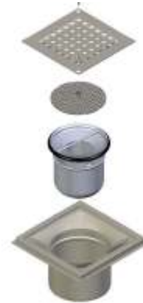
KVT 162.110 TP Assembly.