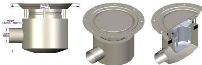
KHV 162.050 side outlet suitable for vinyl floor covering